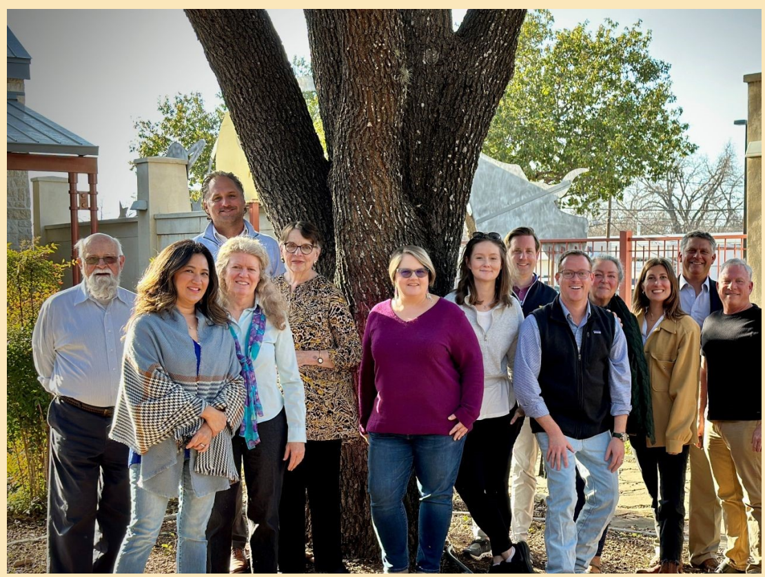
CCCA Board and Staff, January 2024

2024 marks an important milestone for CCCA. All the original Board members have now rotated off the Board, having served the maximum of 6 continuous years allowed by the bylaws. It is not possible to overestimate the contribution these and all former Board members made to setting deep roots in Comal County for CCCA. We are forever in their debt. In 2024 there is the first new president in six years; the Executive Director will start his first full year; and five new people are joining the Board. The mission to preserve land, water, and wildlife in Comal County won't change. You can still expect to see a monthly newsletter, bi-monthly public programs, and visits with volunteers at outreach tables at events across the County. At the same time, we will be branching out, giving new ideas a try. We remain committed to working respectfully with governmental bodies, other non-profits, landowners, and concerned citizens to find common ground and solutions for the environmental challenges facing Comal County.