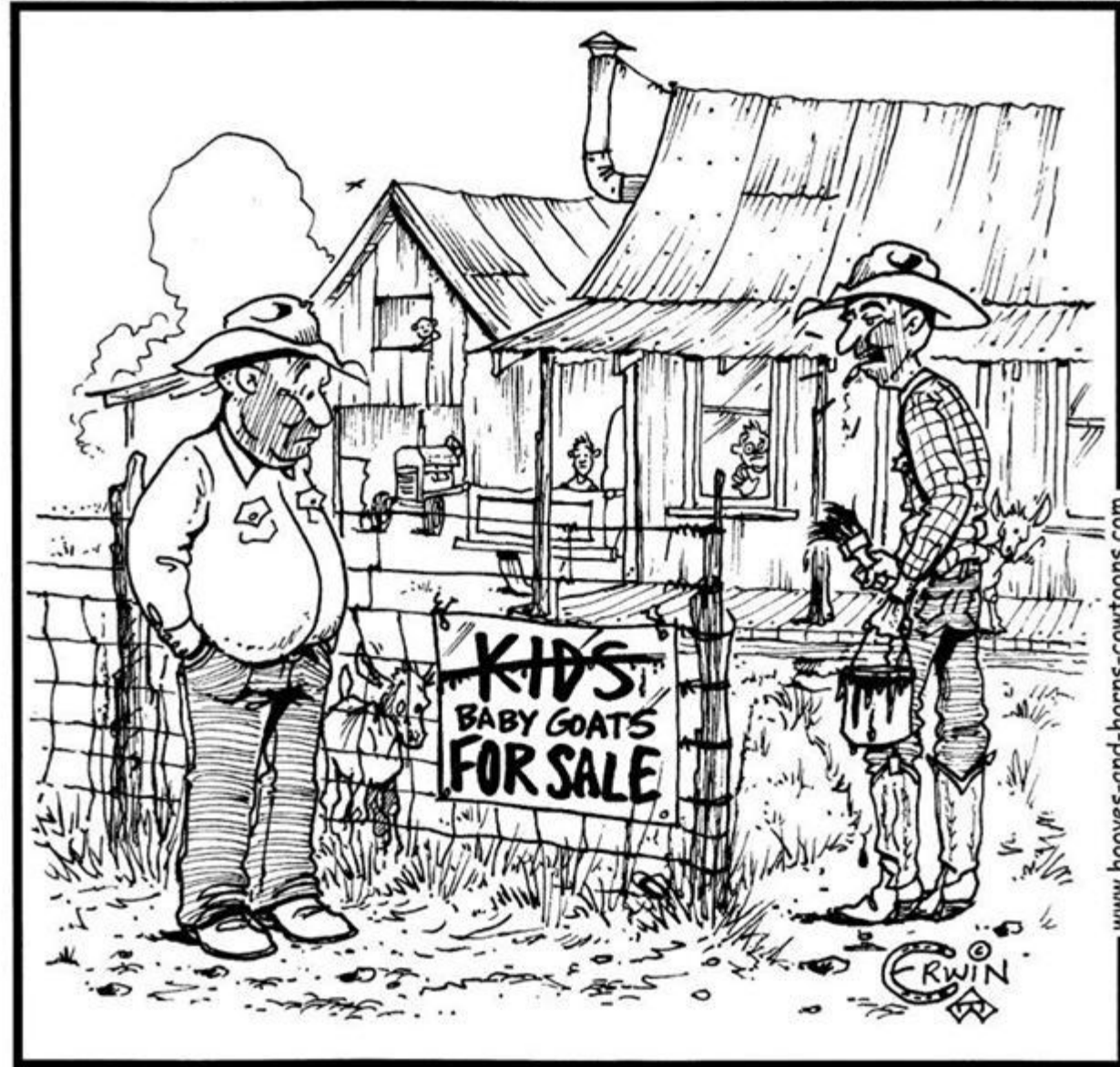
"Yeah, my wife said it was scaring the children."